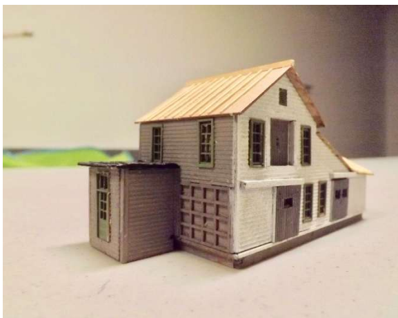
Don Cooper brought in a Bar Mills kit of the Old Dominion Brewing Company, N scale.

Remember to bring a model to the meeting to show to other members and be entered in a random draw. Please include a short write-up on what you did so it can be included in the next Lantern. December Model Display winner was Don Cooper.