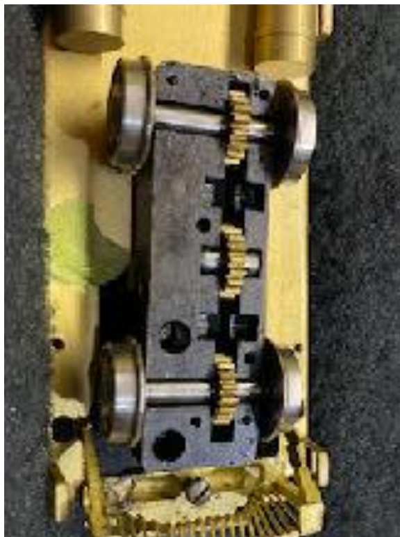
The gears are quite small and two different sized axels.

It was sold as “needing work” but it was such a well-made model I had to buy it. On the track it would go about 3 inches and stop, when reversed, 3 inches back. The model has one powered truck with a universal connected to the motor. When disconnected the motor ran smoothly with no issues. On removal of the bottom cover plate and opening the gear tower I found three plastic gears meshing to brass gears. On close inspection all three were cracked so jammed when the crack rolled around.