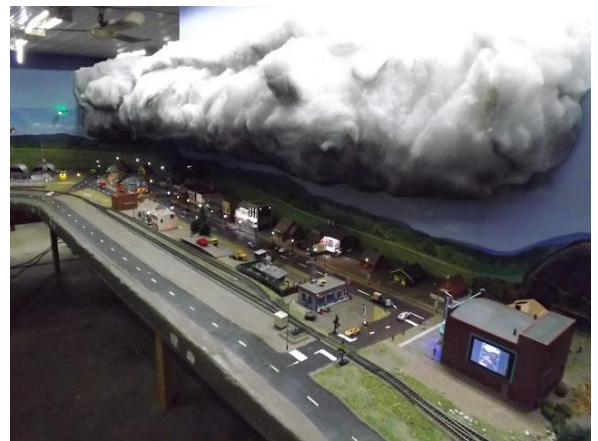
A huge thundercloud threatens this prairie railroad town. Press a button below the layout and you can hear the thunder and see the lightning!