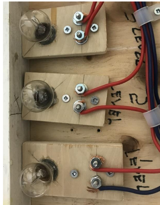
Three Short Circuit devices installed under the layout.