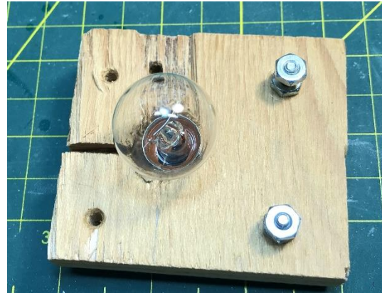
"Top" side of device

The circuit consists of a #1156 12V Auto Bulb (single filament). This is wired in series with the normal track wiring. I mount the bulb in a hole in a piece of scrap wood with the leads from the bulb connected to a pair of terminals made from 6-32 screws. This allows me to solder the wires to the bulb right side down at the work bench. The 6-32 screws allow for easier connection to the track wire bus once mounted under the layout. Double nuts are added to the "top" side of the screw, with the bottom one tightened to hold the screw in place with the second one used to secure the track wire. Top and bottom are relevant, as things get turned upside down once it is mounted under the layout. A pair of holes are drilled into the plywood to allow for wood screws to secure it to the underside of the layout.