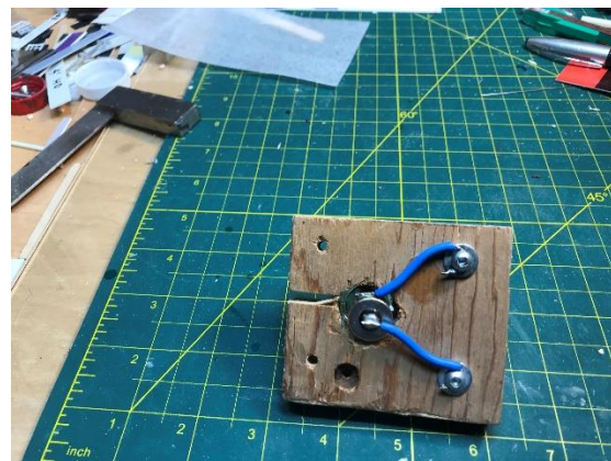
"Bottom" of device